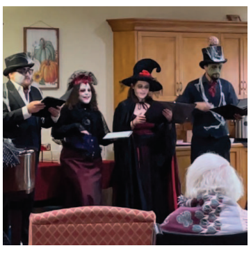
December 2022 - 7