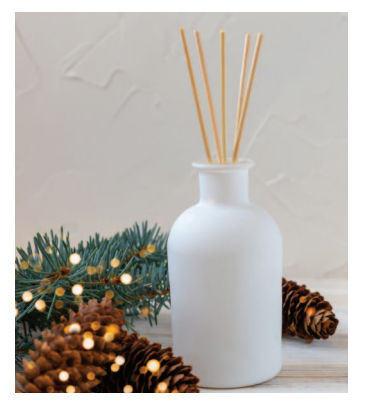
Smells good! Holiday Reed Diffusers

Friday, 12/02 | 3:30 pm Bringing that special holiday smell straight into your home is what this craft is all about.