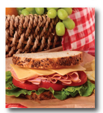
Picnic at the Park October 12 at 11:30 am Delight your inner child and enjoy the great outdoors, we're going on a picnic!