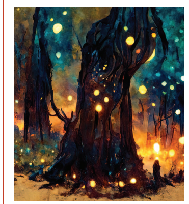
Pick Your Scene Witchy Landscape Canvas & Acrylic Painting Series Friday, 10/21 at 3:30 pm