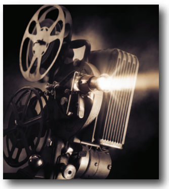
Let's Go To The Movies! October 26 at 12:30 pm

This museum has everything! From the gardens, to their famous library and art exhibits, this outing is a So Cal favorite.