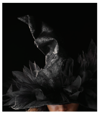
Cast a Spell Decorate a Witch's Hat Friday, 10/21 at 3:30 pm With a little style and whimsy, an ordinary witches hat becomes a wicked centerpiece!