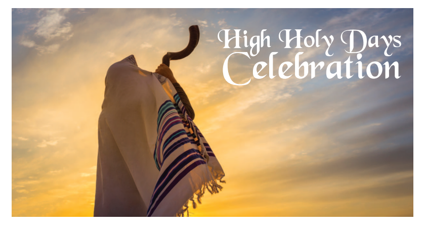
Yom Kippur, Sukkot, Simchat Torah SEPTEMBER 25 TO OCTOBER 18 PM

If the Jewish year were a train, the High Holy Days would be its engine. These ten "Days of Awe" are a fine blend of joy and dignity, feasting and fasting, prayer and dancing, regret, reflection and celebration. The High Holy Days mark the height of the Jewish New Year.